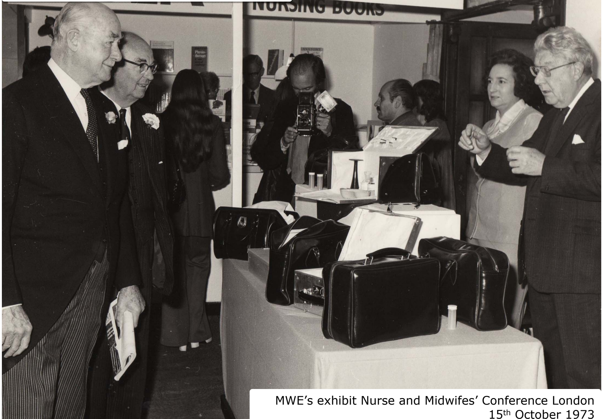
MWE's exhibit Nurse and Midwives' Conference London 15 th October 1973